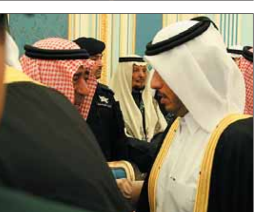
HH the Deputy Emir Sheikh Abdullah bin Hamad al-Thani offered condolences to the Custodian of the Two Holy Mosques King Salman bin Abdulaziz al-Saud, Crown Prince Muqrin bin Abdulaziz and Deputy Crown Prince Mohamed bin Nayef bin Abdulaziz al-Saud on the death of King Abdullah bin Abdulaziz al-Saud in Riyadh yesterday. HE the Prime Minister and Minister of Interior Sheikh Abdullah bin Nasser bin Khalifa al-Thani also offered his condolences to the family of the late king. The Deputy Emir and the Prime Minister were received by Majid bin Abdullah bin Abdulaziz al-Saud and Qatar's ambassador to Saudi Arabia, Sheikh Abdullah bin Thamer al-Thani, on their arrival at the Riyadh Airbase earlier. Pages 3, 8